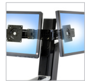
Hinged Bow for WorkFit-S 97-583-009 (black)