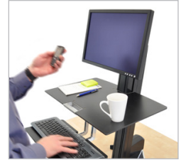
Worksurface for WorkFit-S 97-581-019 (black)

This kit converts a WorkFit-S, WorkFit-C or WorkFit-A Dual Workstation into a WorkFit LCD & Laptop Workstation