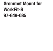
Grommet Mount for WorkFit-S 97-649-085