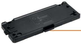
OUTPUT TRAY OT-1001C