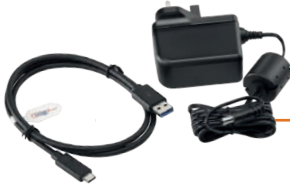
LEGACY KIT LK-1001CEU / LK-1001CUK