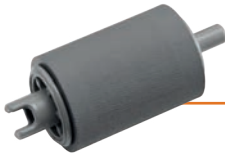
PICKUP ROLLER PUR-2001C