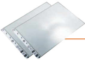
CARRIER SHEETS CS-A3301