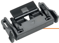
SEPARATION PAD SP-2001C